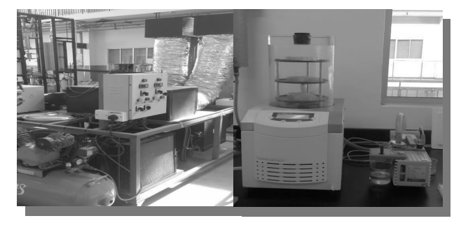
(a) (b) Figure 1. System set-up of (a) heat pump and (b) freeze drying

Before being freeze dried in a laboratory freeze dryer as in Figure 1(b) at different drying times, fresh flat-rice noodles were kept inside an FZ-220 deep freezer supplied by Mistral, Khind (M) Sdn Bhd. overnight at -18°C. The frozen noodles should be inserted into the drying chamber immediately as any thawing should not be tolerated for the optimum drying efficiency. Before starting up with the experiment, the vacuum pump is turned on for 30 minutes to create a vacuum inside the chamber. After that, the operating conditions were set to run for 24 hours under two different parameters which are -10^{\circ} C (259.90 Pa) and -40^{\circ} C (12.84 Pa) for the main drying at the range of noodle collapse temperature (-30 °C) (Chen, 2008).